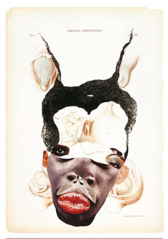
The Histology of the Different Tumors of the Uterus 2001, Collage on Medical Illustration paper, 18 x 12", Courtesy the artist and Susanne Vielmetter LA Projects