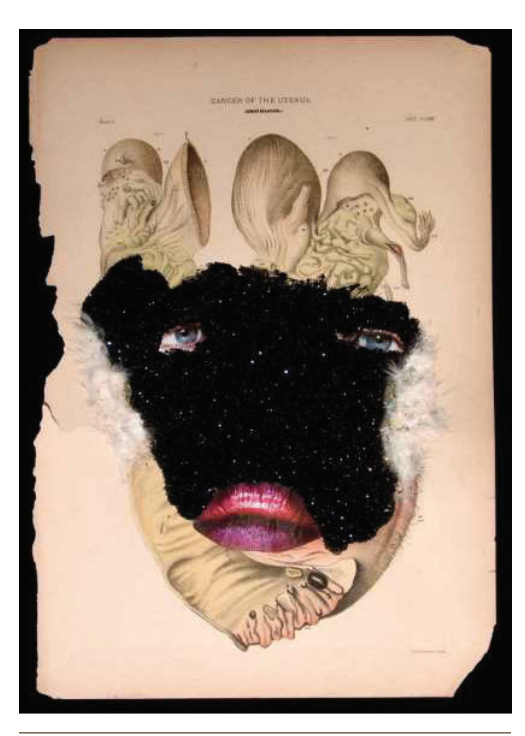
The Histology of the Different Tumors of the Uterus 2001, Collage on Medical Illustration paper, 18 \times 12 ", Courtesy the artist and Susanne Vielmetter LA Projects