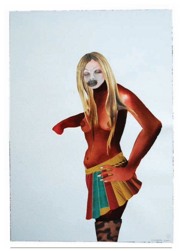
Pin-Up 2001, Ink & Collage on Paper, Courtesy of the Artist.