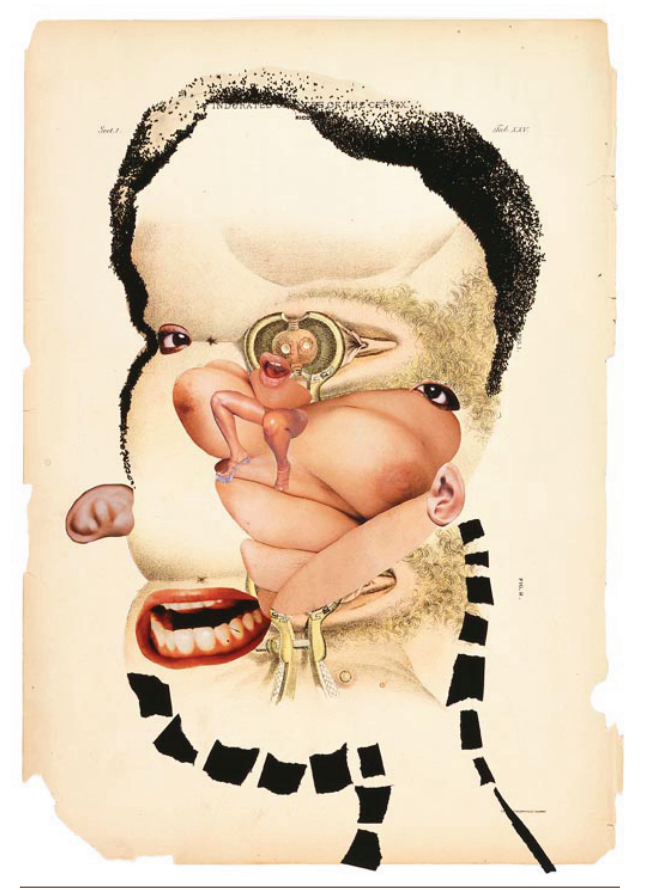
The Histology of the Different Tumors of the Uterus 2001, Collage on Medical Illustration paper, 18 x 12", Courtesy the artist and Susanne Vielmetter LA Projects