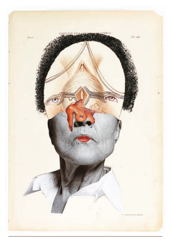
The Histology of the Different Tumors of the Uterus 2001, Collage on Medical Illustration paper, 18\times12 ", Courtesy the artist and Susanne Vielmetter LA Projects