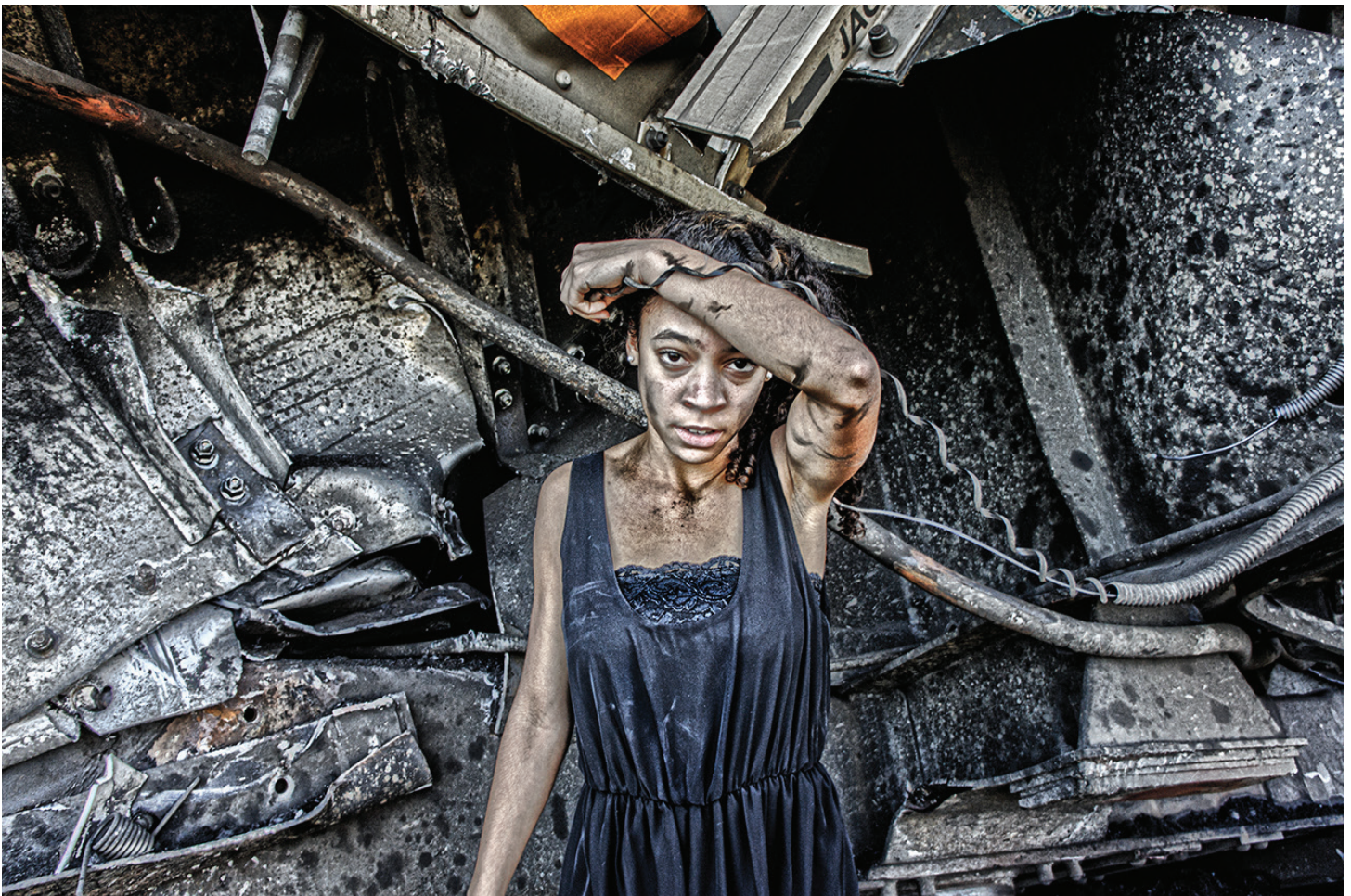
The Aftermath by Kessler McGarry 2013 First Place Winner

INFO: The contest is open to all high school students and will culminate in an exhibition at the photography program gallery in February 2015. High school students may enter all types of photographic processes (black/white, color, silver prints, digital prints, and historical processes). All submissions for the 2014 Drexel University High School Photography Contest must be submitted online to https://drexelphoto.slideroom.com and all submissions must be received by NOVEMBER 26, 2014