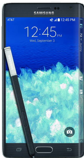
Samsung Galaxy Note® Edge