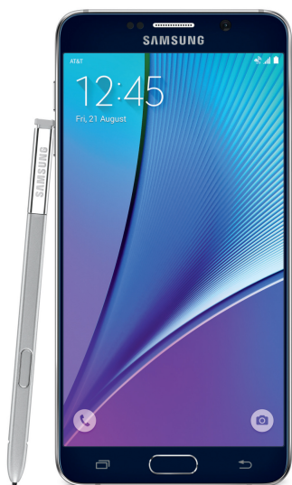
Samsung Galaxy Note5