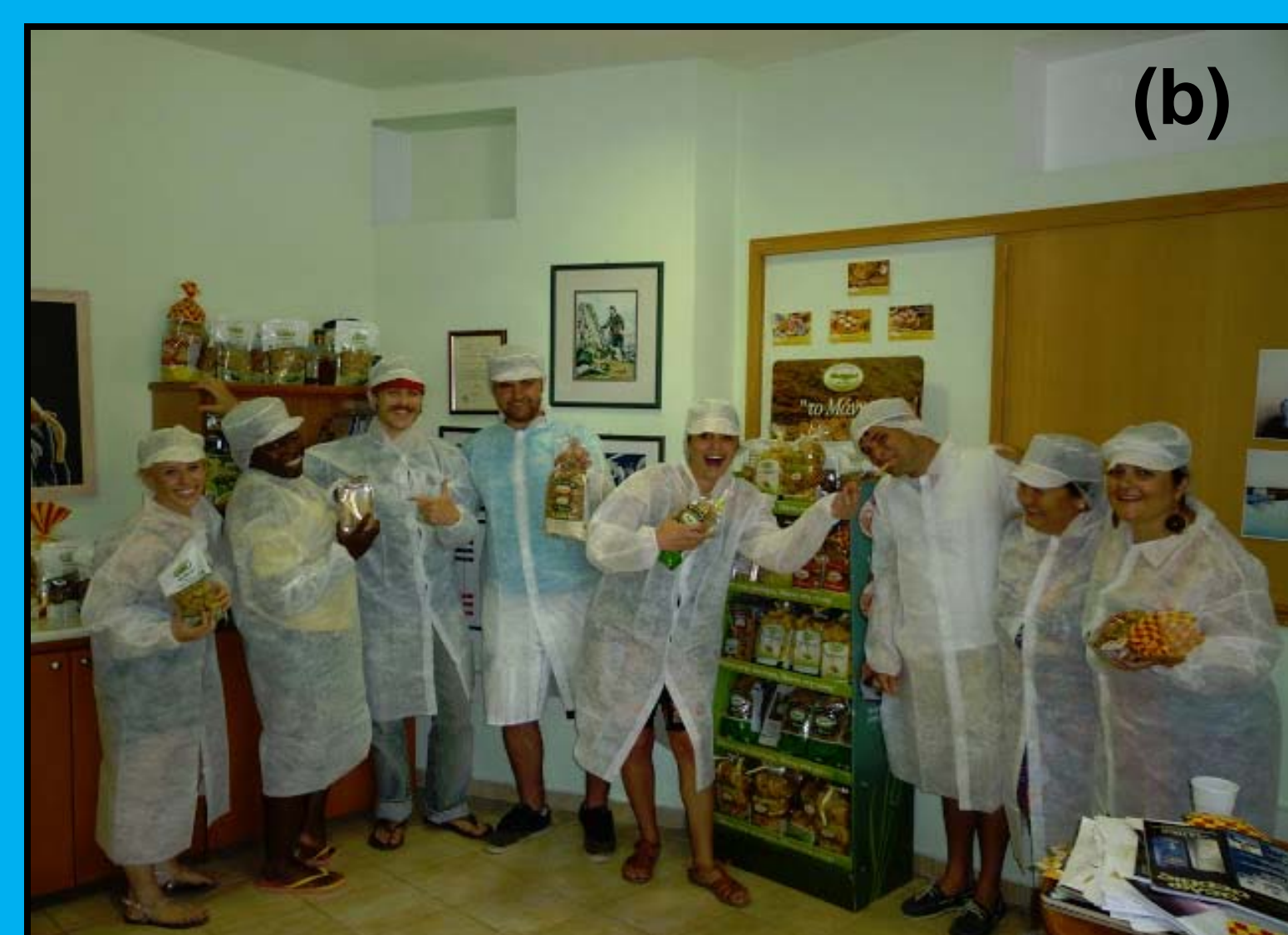
(a) STUDENTS MAKE THEIR OWN CERAMICS IN THE ORIGINAL MINOAN POTTERY PLOUMAKIS LAB (b) STUDENTS BAKE THE "RUSK", THE BASE OF MEDITERRANEAN DIET, IN THE FAMOUS TO MANNA BAKERY, THE TOP RUSK PRODUCER